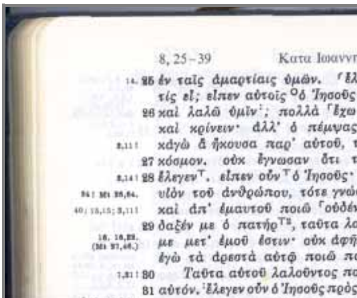
25 th edition of the Nestle-Aland Greek New Testament, now changed in over 600 places.

different English versions. It surprised me to learn that modern scholarship did not believe what I had been taught as a child. I went back to one of the faculty members at my old college and discussed it with him. I discovered that he was not able to hand me just one book in any language and assure me that it was the inerrant, perfect words of God. No one in my college had ever so much as seen such a book.