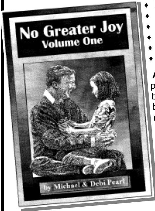
104 page paperback book