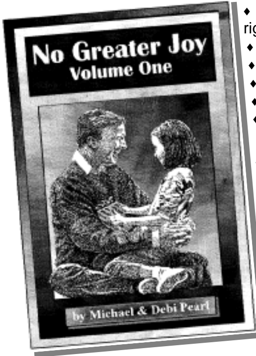
108 page paperback book