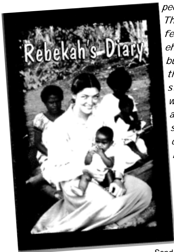
1112 pages - paperback

I'm here! We took a small plane, 5 seater, single prop, turbo, for 35 minutes inland. We flew past the highest mountain in P.N.G., snow covered, Mount Wilhelm. Then we landed on a small grass airstrip where about 150 natives were waiting. They loaded up our backpacks, put the food in their bilams, and we started up the mountains. And climbed up and up and up until I was sure we must have passed the moon and sun too. The villagers were