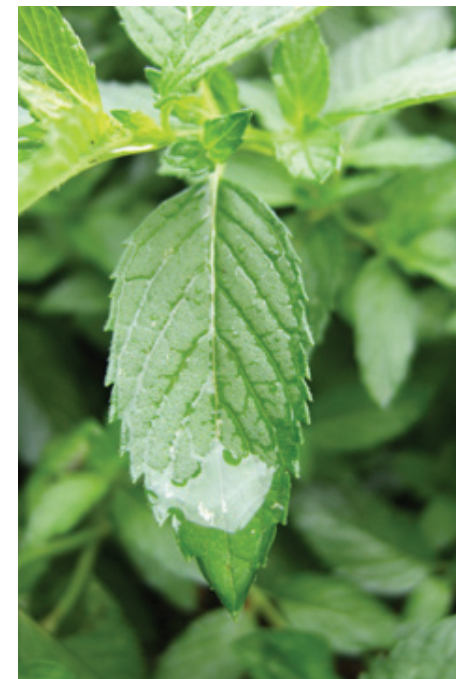
Rain on a Spearmint leaf