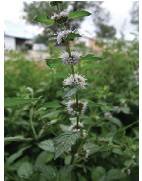
Spearmint in blossom

(This is useful to rub gently on a colicky baby's tummy to help relax the muscles.)