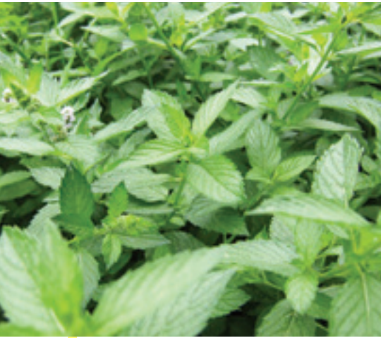
Spearmint grows well in wet soil