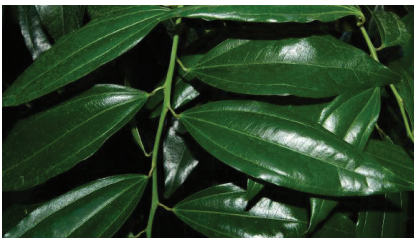
Cinnamomum Verum Leaves

Carminative, astringent, topical stimulant, aphrodisiac, anti-fungal, antibacterial, diuretic, digestive stimulant, antiseptic.