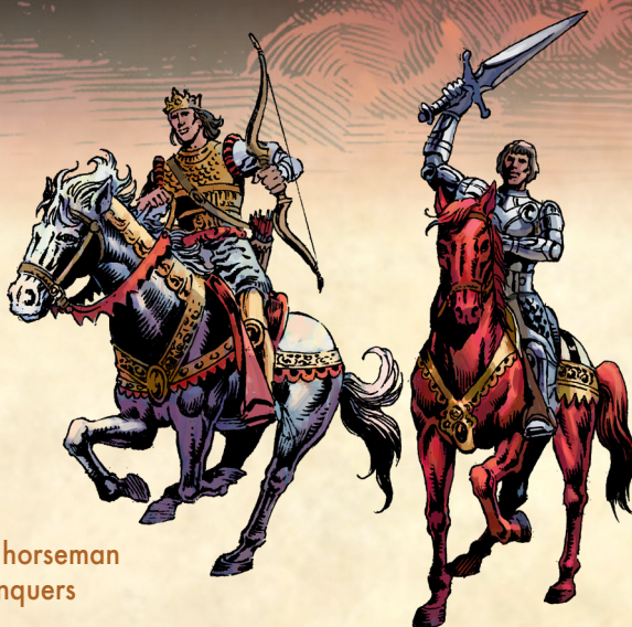
White horseman conquers