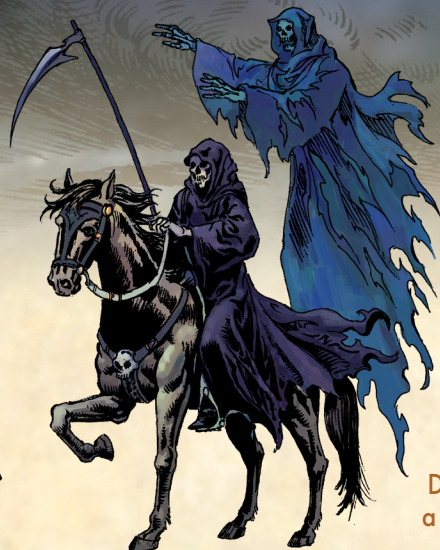
Hell follows Death