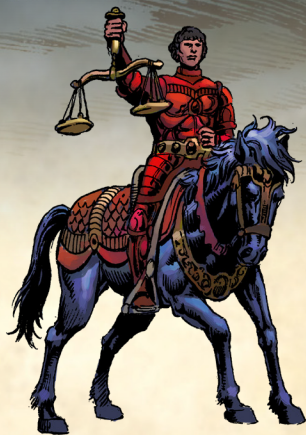
Black horse of famine